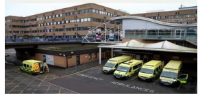
Hospital - QMC